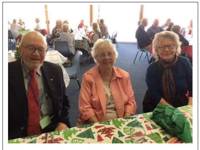
The Christmas Luncheon and its merry rebels!